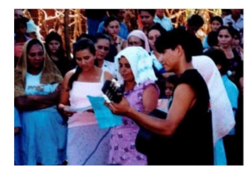
A stop on the Via Cruces, remembering God's deliverance and the martyrs of the Salvadoran civil war.