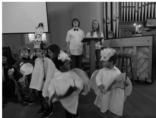
The Children of Hope Fellowship perform their Christmas play

When we began fostering our son as a 3 month old in 2010, we quickly learned how much this would be a shared