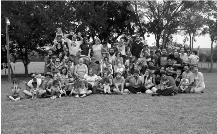
Hope Fellowship folks participate in the annual Easter Retreat