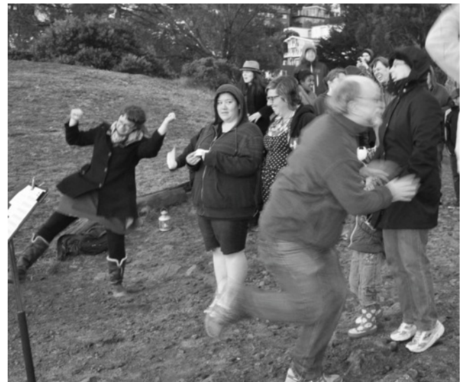
Church of the Sojourners celebrates the Resurrection